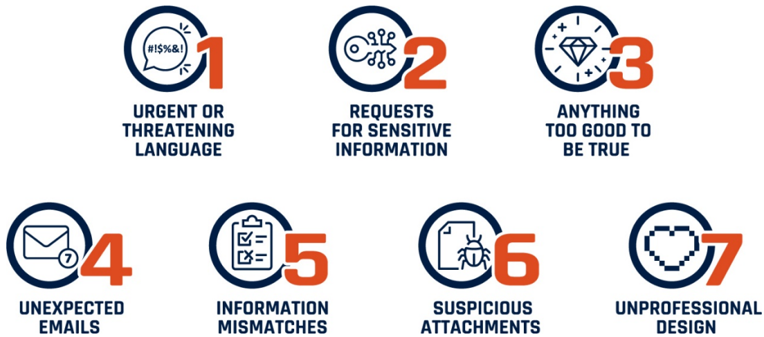
Figure 2: The Elements of Malicious Communication (Reference: NCTA 2020 )

Ransomware (Figure 3) is a type of malware that will make your data inaccessible (e.g., locking systems and encrypting all files) until a ransom is paid. For more information, see ITSAP.00.099 Ransomware: How to Prevent and Recover.